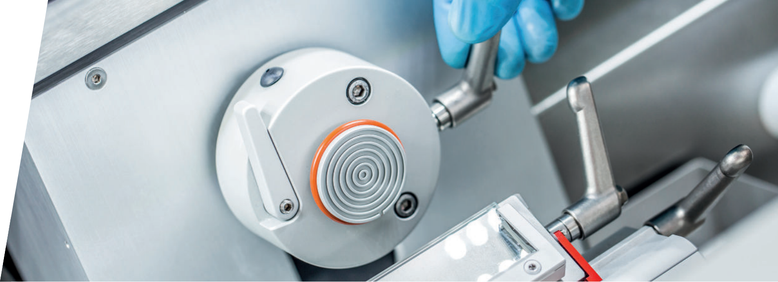
MNT stainless steel cryochamber with modern rotary microtome and specimen holder